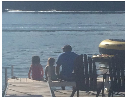
waiting patiently for the boat parade to pass