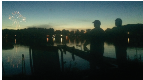
Lighting up the lake