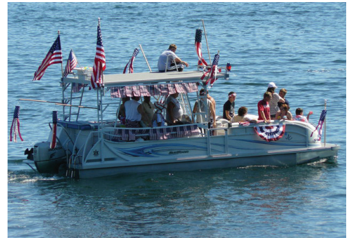
Cedar Lake Patriotism