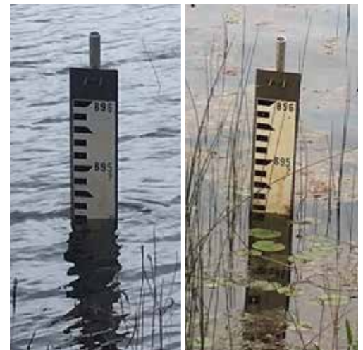
Our staff gauge next to M-40. Left was taken May 3 and right, May 29. Considering all the rain we have had, this is some progress albeit, very slow.