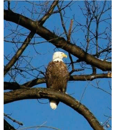
Cedar Lake eagle