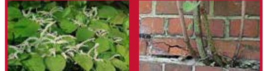
LATE SUMMER/FALL: Watch for sprays of white flowers.