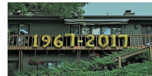
Celebrating 50 wonderful years on Cedar Lake!