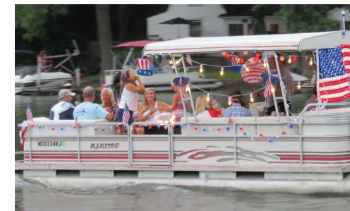
2017 '4th of July' boat parade fun!