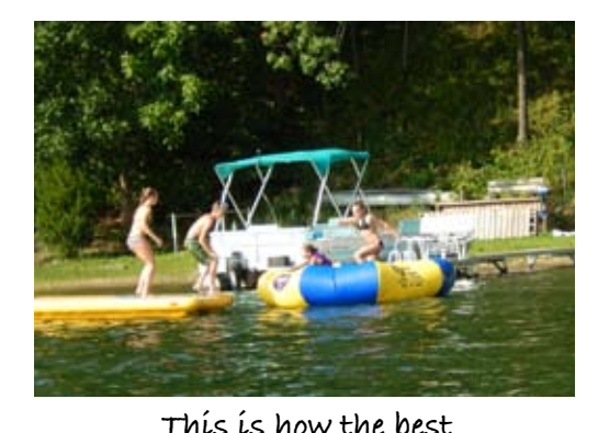
memories are made