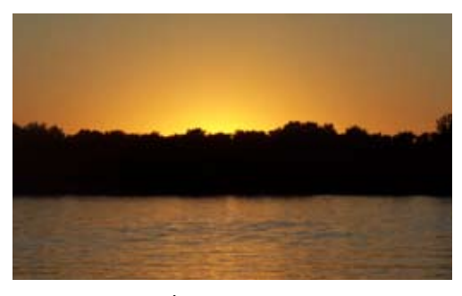
A Cedar Lake sunset never disappoints