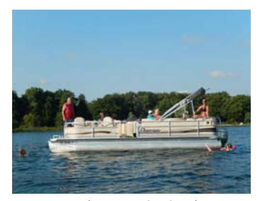
The Liebendorfer family "cooling off."

• Underground — SWT plans to start up a third crew on Monday, 04/21/2014. Crew 1 will continue on the current route and estimates reaching M-40 by mid-May. Crew 2 will be continuing installation of main line sewer and services along Shore Lane Drive and anticipates finishing this work and moving to Becker Beach Drive by 06/01/2014. Crew 3 will begin work on 04/21/2014 at Willow Drive installing main line sewer and services. Crew 3 is scheduled to finish work on Willow Drive by 06/01/2014 and will then move to Becker Beach Drive to join Crew 2.y. ❖