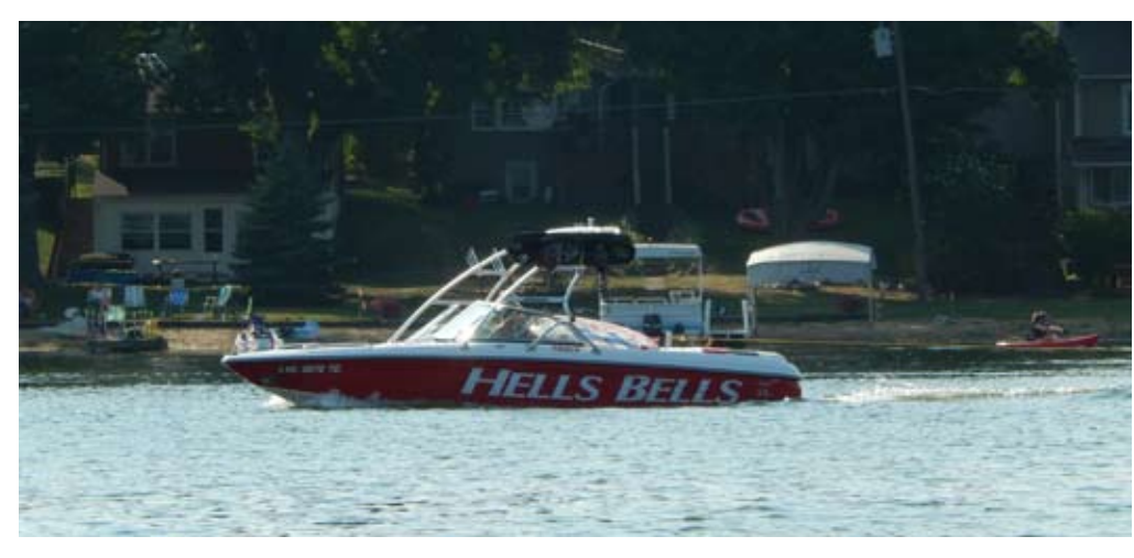
The Harvey family in their favorite summer mode of travel!

Answer to the cottage photo in the Fall edition: Who's cottage is this? Answer: Pat & Diane Battaglia