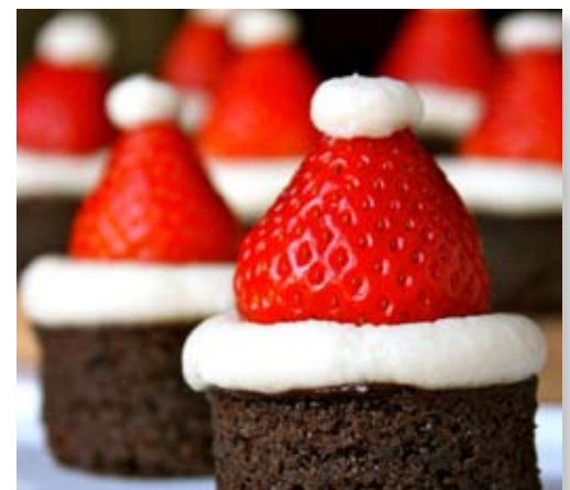
Bite-size brownies topped with cream cheese frosting and a strawberry. Sweet!