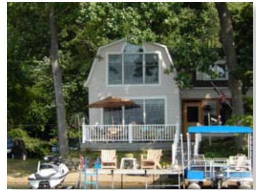
Summer living at its best! Do you know who lives here?