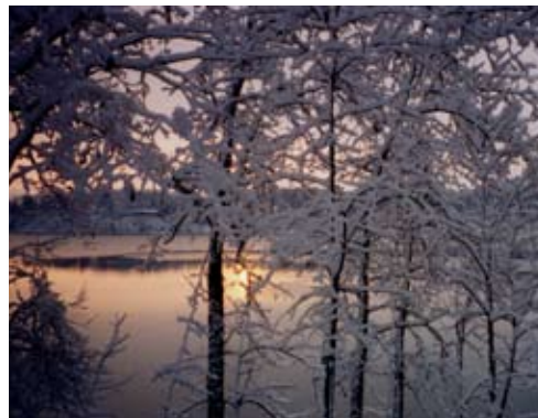
Frosty trees from Becker Beach