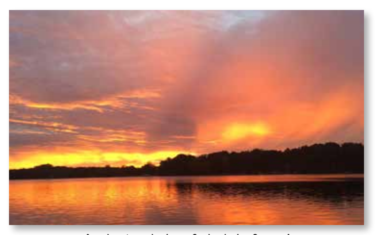
Another breathtaking Cedar Lake Sunset!